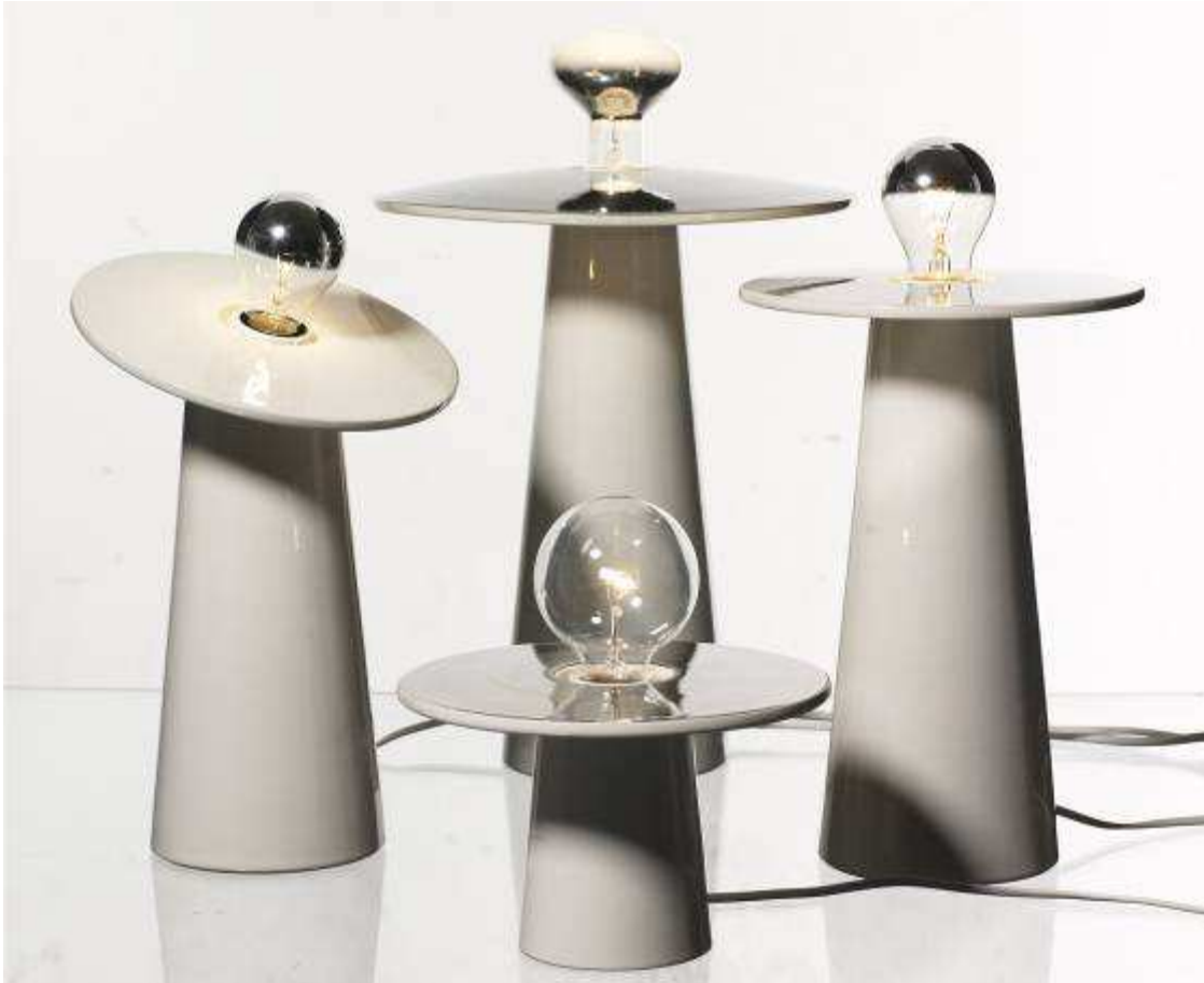
Above: Solaris lamps, Edition Ligne Roset

Jeglinska will be exhibiting Solaris, a collection of four porcelain lights designed as a generic base / table lamp that adapts to every typology of bulb. The ceramic cone is made out of two moulds, one for the base and another for the disc.