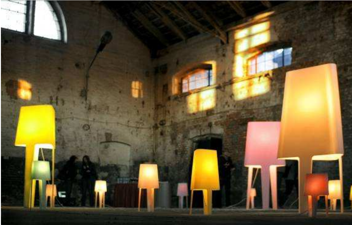
Above: Genotype by Tomek Rygalik

The exhibition will showcase his latest lighting project, Genotype, a three-dimensional installation of lights made of DuPont™ Corian® utilising Illumination colour series.