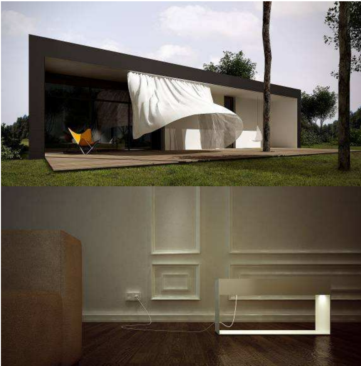
Above top: s house

Moomoo will be showing it's Luf lamp, s house and hoUSEview, a house that enables a 360° view of its surroundings combined with an endlessly flexible interior space facilitated by moveable interior walls.