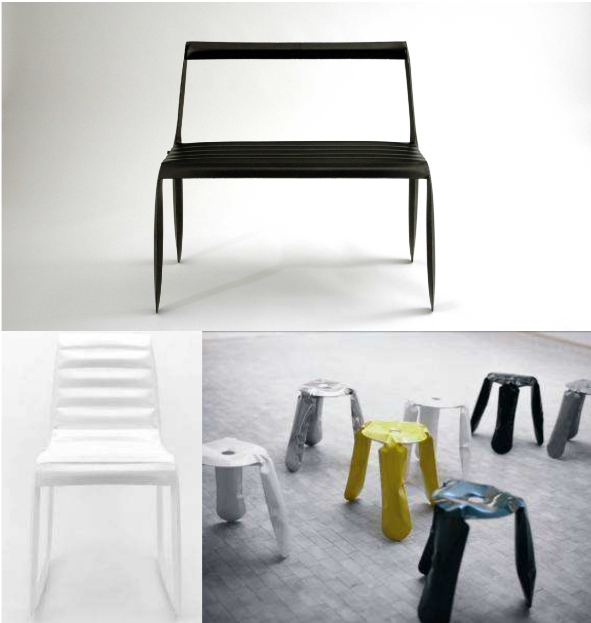
Above top: Bench in fidu technology (free inside pressure forming) Above left: chair in fidu technology and right: Plopp stool for Hay