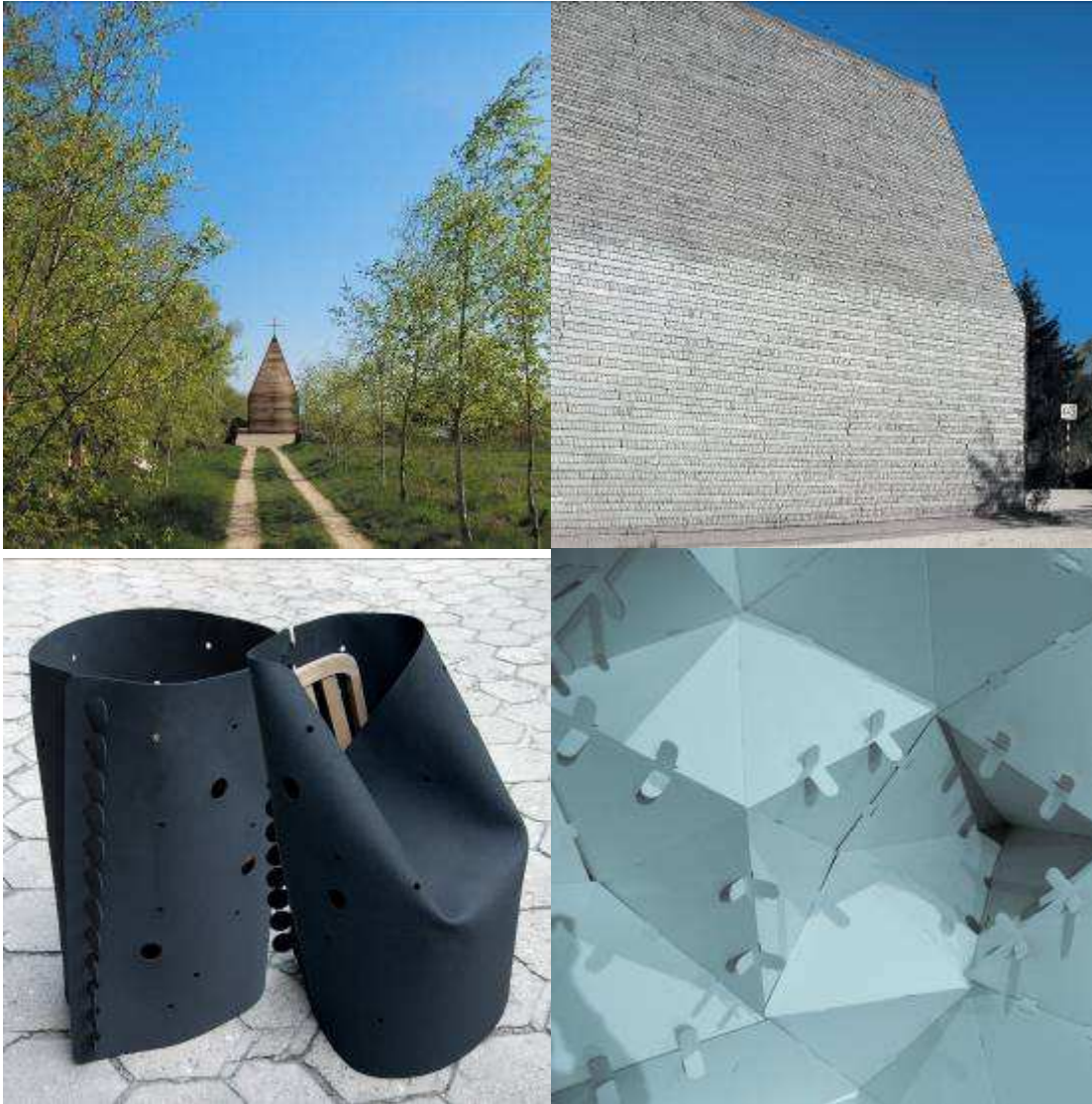
Clockwise from top left: church in Tarnów, Wall, S (chair transformers)

Beton will be showing some of their recent projects, including the wooden church in Tarnów, Poland.