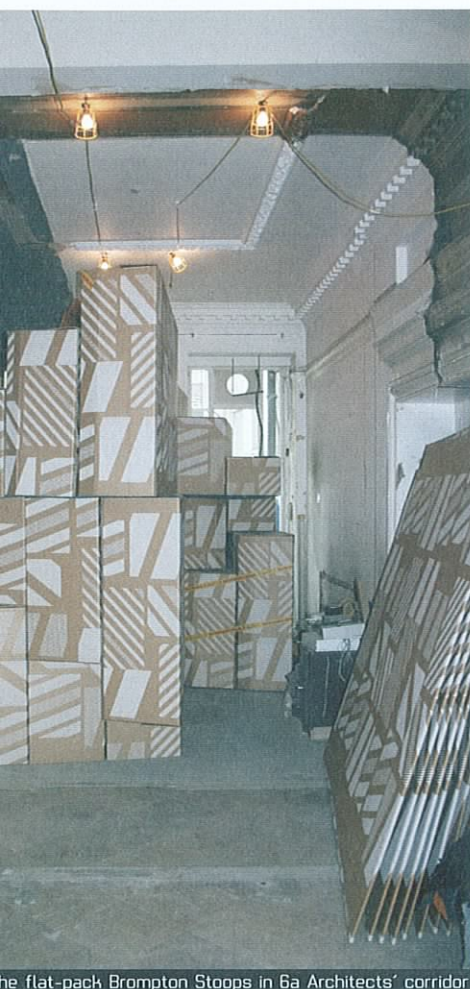
The flat-pack Brompton Stoops in 6a Architects' corridor

Not the best news for an event that saw Exhibition Road filled with hundreds of cardboard structures. But the clouds cleared and the Brompton Stoops, designed by 6a Architects and patterned by icon, hit the street.