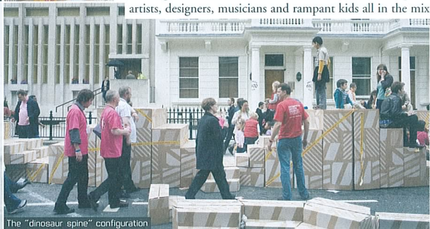
The "dinosaur spine" configuration