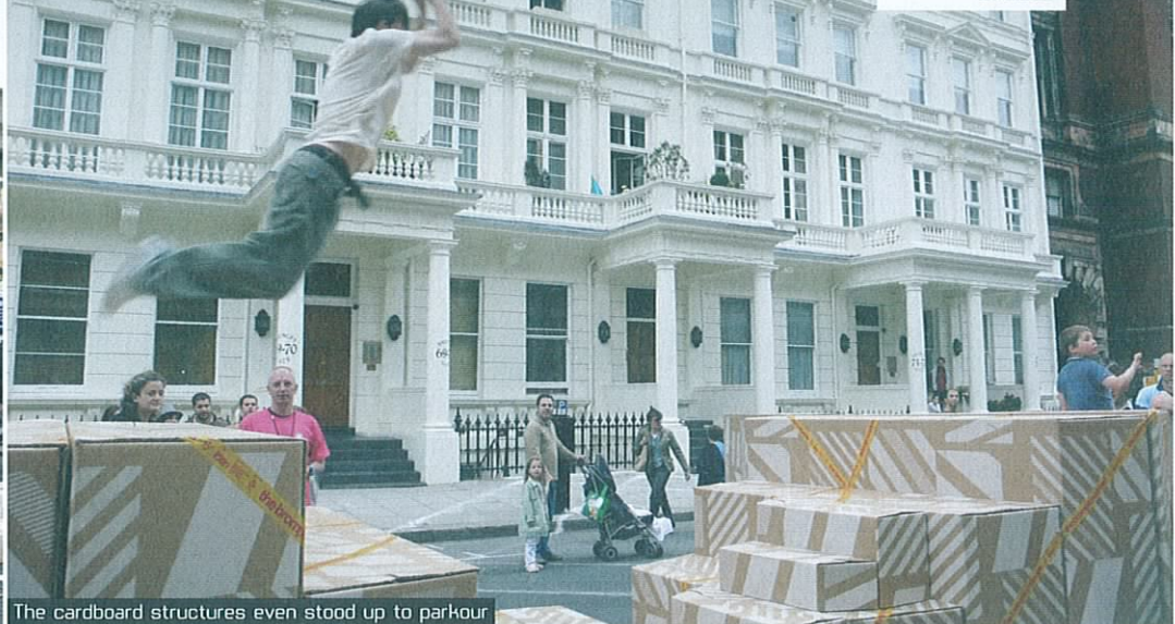
The cardboard structures even stood up to parkour