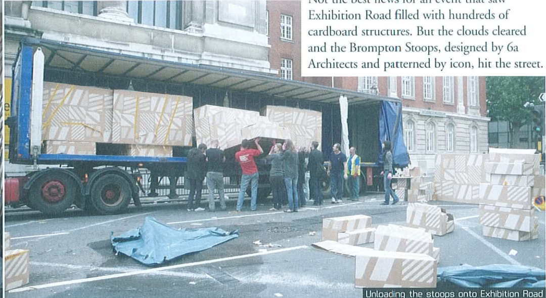
Unloading the stoops onto Exhibition Road