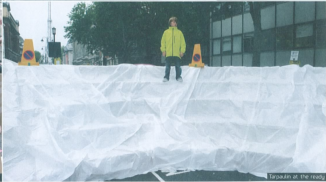
Tarpaulin at the ready