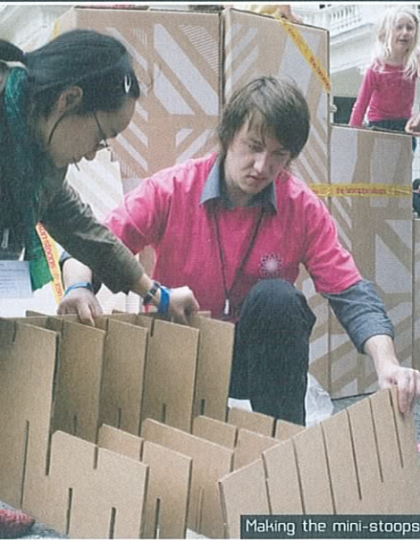
Making the mini-stoops